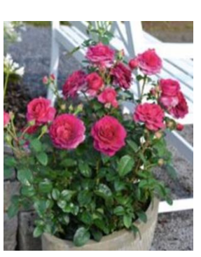
Lipstick (rich reddish-pink)