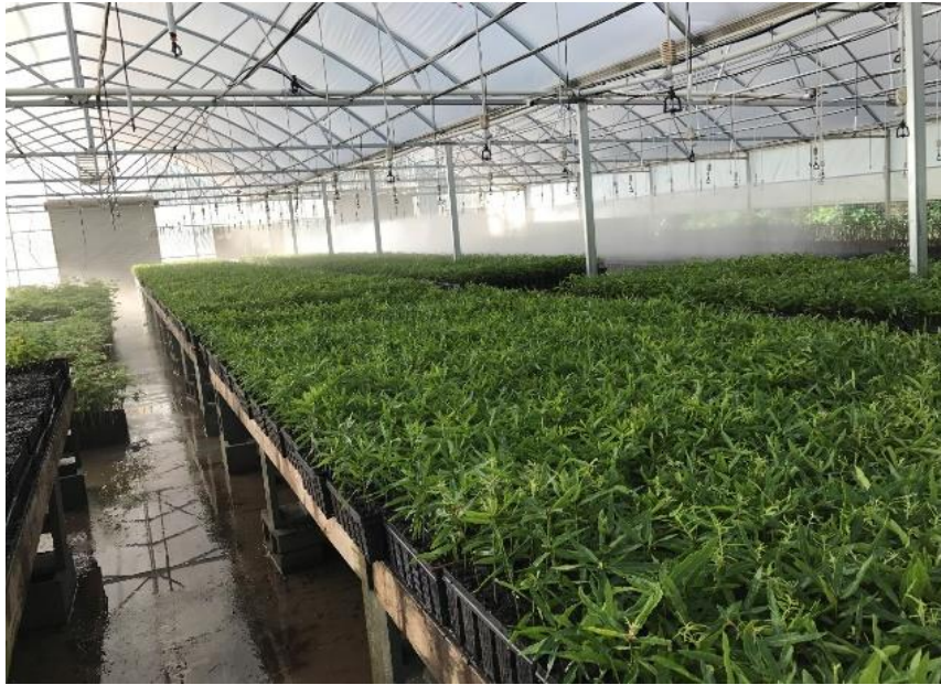
Figure 1. Mist propagation of Quercus phellos (Willow Oak) cuttings.

15-20 cm (4 to 6-in.) long softwood cutting are harvested from clean, healthy, vigorous growing plants which are free of disease and insects.