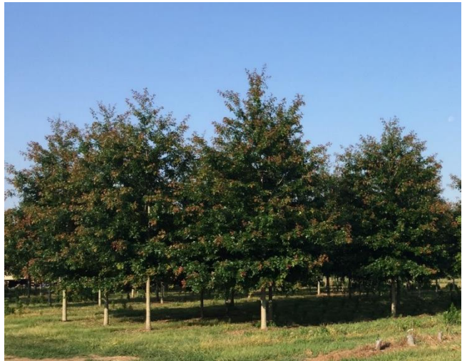
Figure 5. Clonal Quercus nuttallii ‘QNMTF’, Tylest® (Nuttall Oak) propagated from cuttings and transplanted into 3-gal containers (left). Field grown Quercus nuttallii ‘QNMTF’, Tylest® (Nuttall Oak) propagated from cuttings (right).