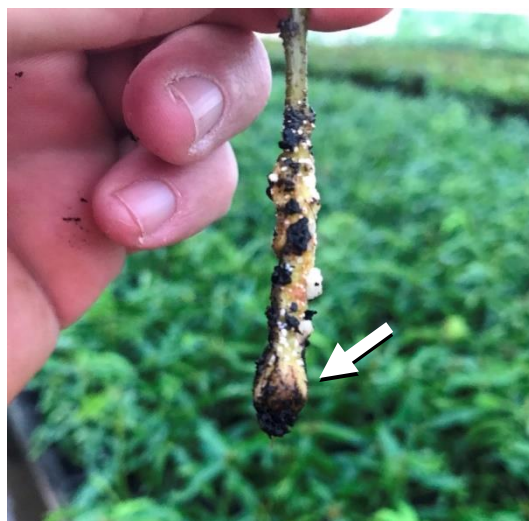
Figure 2. (Left) Callus development (arrow) of Quercus phellos (Willow Oak) cutting, after 3-weeks, and (right) rooting (arrow) of cutting.