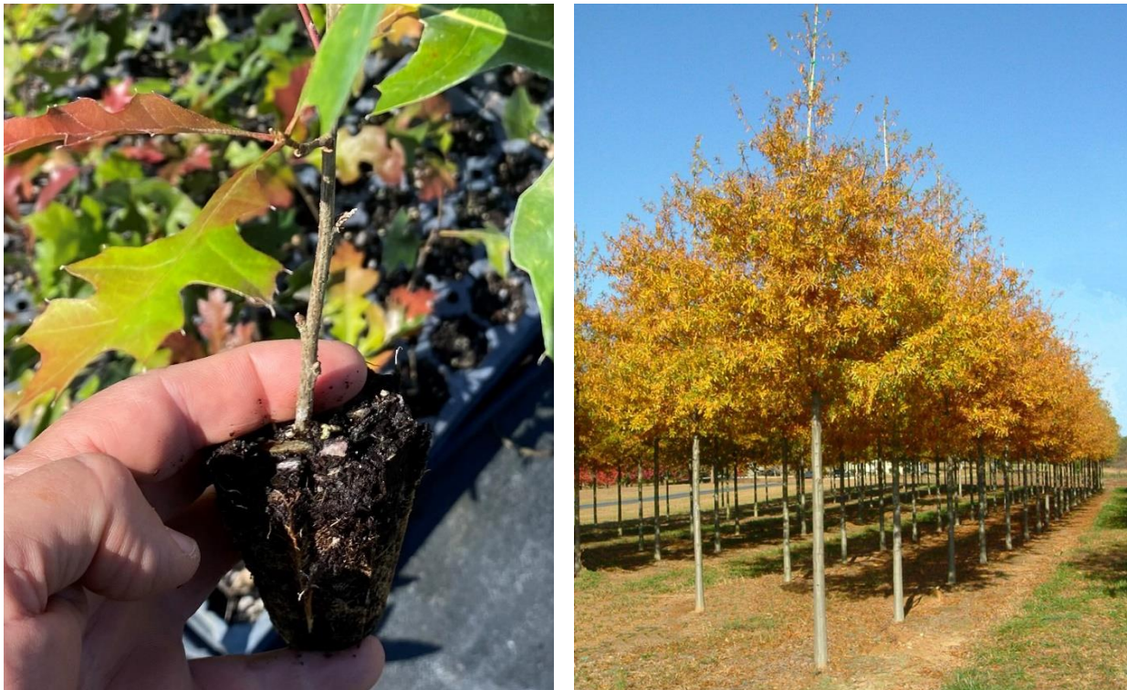
Figure 3. (Left) Rooted liner of Quercus phellos ‘QPMTF, Wynstar® (Willow Oak), and (right) clonal trees under field production.

is a combination of 2 parts bark fines and 1 part Pro Mix BF ( Fig. 3 ).