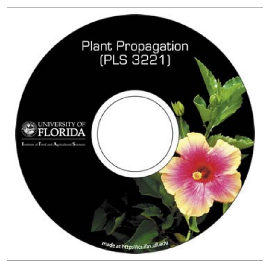
Figure 2. Compact disc developed for the delivery of streaming video lectures, lecture notes, nursery tours, and the plant life cycle animation to supplement videoconferenced lectures for statewide delivery of Plant Propagation.

Coordination of a Plant Propagation Laboratory at Multiple Sites. The teaching team recognized that the independent plant propagation lab courses could benefit from coordination of the laboratory exercise content. While members of the teaching team had previously developed and taught laboratory sections of plant propagation, the addition of new sites with various levels of facility, equipment, and materials availability could be a disadvantage to developing a cohesive state-wide laboratory course. The coordinator of the plant propagation teaching team, through input from the plant propagation teaching faculty, facilitated the development of a list of common laboratory topics or concepts, and sequence of delivery to compliment the six course modules. The idea was for the individual lab instructors to retain responsible for the development of site-specific laboratory exercises and activities based on the equipment, materials, and plant species available at a given site. Additionally, laboratory examinations are developed, administered, graded, recorded, and reported by the lab instructor.