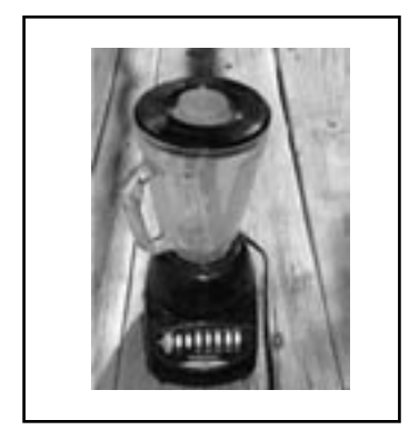
Figure 3. A common kitchen blender used for cleaning seed prior to sowing.