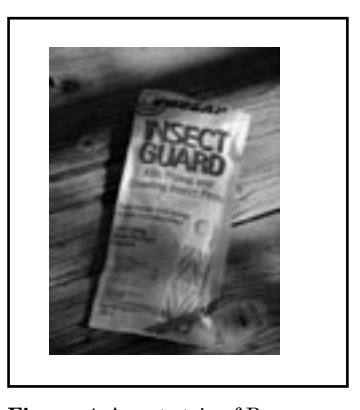
Figure 4. A pest strip of Prozap Insect Guard™ used to control weevils and insects in seed batches.