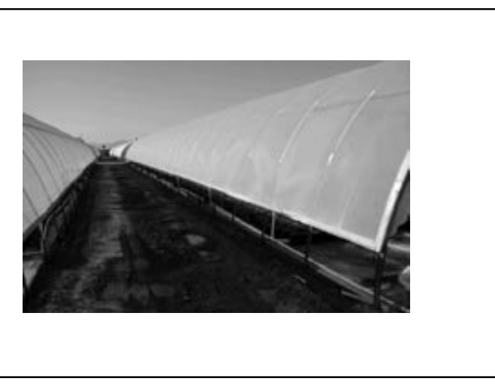
Figure 1. Quonset houses with side ventilation systems for better temperature control.