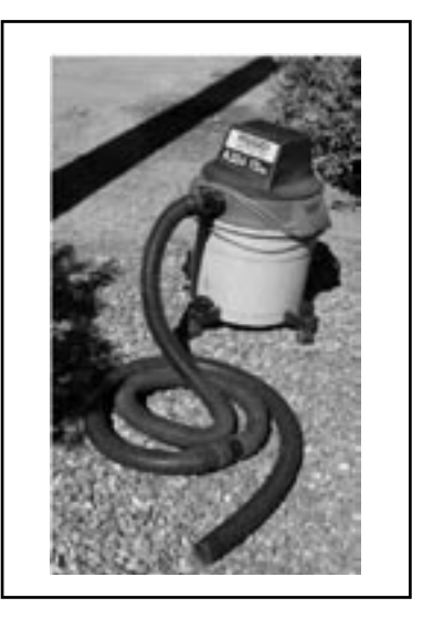
Figure 2. A standard shop vacuum used for sucking-up seed and detaching the seed from floral structures.

hose attached to it (Fig. 2). We put as many bends in the hose as possible and usually run the seed through this a few times. The corrugated hose will break-up the papery flowers and we can then sift the clean seed out. As an alternative and for harder materials,