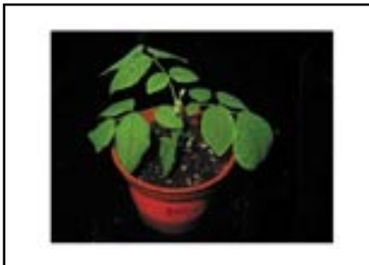
Figure 3. A cloned and acclimatized plant of Cladrastis kentukea .

Significant differences ( P < 0.05 ) were observed with the explants exposed to 300 \mu\text{M} of IBA compared to other treatments (Fig. 1). Although this treatment induced the most root formation, there was significantly higher ( P < 0.025 ; F = 4.11 ) terminal meristem abortion compared only to the microshoots treated with 100 and 30 \mu\text{M} IBA (Fig. 2). This suggests that better balance between exposure and timing of auxin treatments for rooting is critical and will require further studies. When exposed to concentrations of 100 and 30 \mu\text{M} of IBA, the number of microshoots that rooted did not significantly differ — 54% and 45% of microshoots rooted, respectively. Also, when comparing meristem tip damage, these two treatments showed no significant difference between each other ( P = 0.7756 ; F = 0.08 ), however, there was significantly less damage ( P < 0.0118 ; F = 7.06 and 0.0356 ; F = 4.78 , respectively) than with microshoots rooted on 300 \mu\text{M} (Fig. 2).