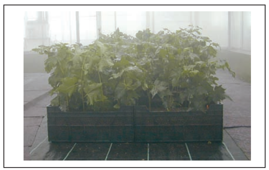
Figure 1. Cuttings of Acer\ platanoides in a box with substrate (peat) in a glasshouse at 95%–100% humidity.