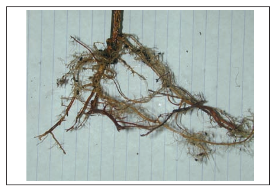
Figure 3. A poorly rooting cutting of Acer platanoides.