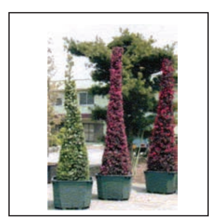
Figure 8. Loropetalum chinense (white, pink, red selection) in CS POT (50 cm in diameter).