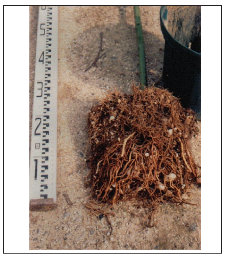
\textbf{Figure 4.} \ \text{Camphor tree.} \ \text{A washed view of Fig. 3 showing a lot of new roots in the middle of the pot.}