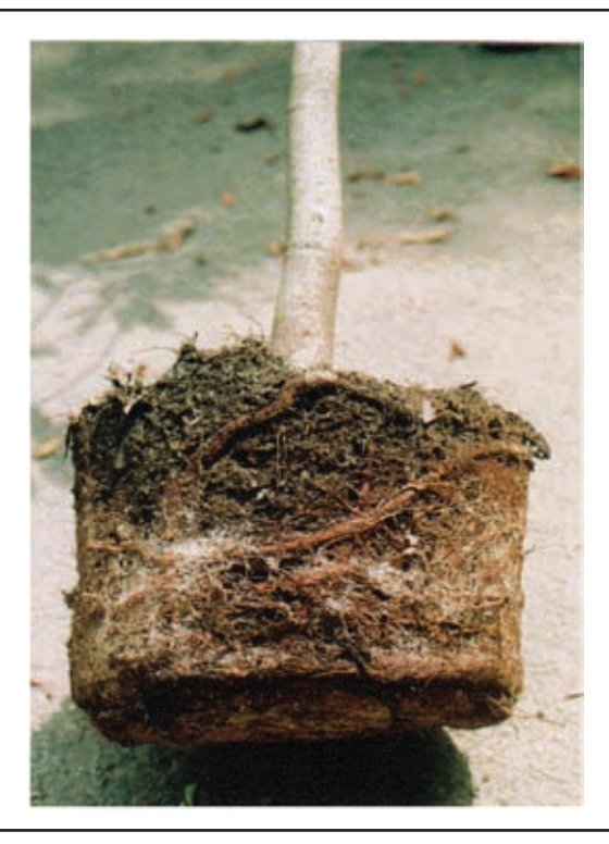
Figure 1. Camphor tree ( Cinnamomum camphora ), 1.8 m in height, in polyester container. The roots have become woody and are circling the container.

(Table 2). The containers made from polyester, vinyl chloride, or plastic drain out most of the excess water after watering; however, some water remains between the container and soil because of surface tension. In addition, the circle holes prevent the soil from getting sufficient air because the water fills such holes owing to surface tension. Also, dew forms inside of the containers because of a difference between the day and night temperatures. This condensation produces too much humidity in the containers. As a result, the roots start circling along the container wall to get sufficient air. Circling roots have two bad influences on the growth of plants. First, plants usually absorb nutrition or water from their root tips. If circling happens, the number of these tips absorbing sufficient nutrition and water decreases. Thus, circling causes the plants to have a reduced absorption power. Second, the circling roots, which become woody because of accumulated lignin, prevent the formation of new roots and cause a plant to age (Fig. 1).