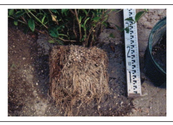
Figure 5. A sectioned diagram of the root mass of Gardenia jasminoides (Cape jasmine) (50 cm) in CS POT (24 cm in diameter). There are lots of new live roots at not only the middle and lower levels but also the upper part of the main root mass.