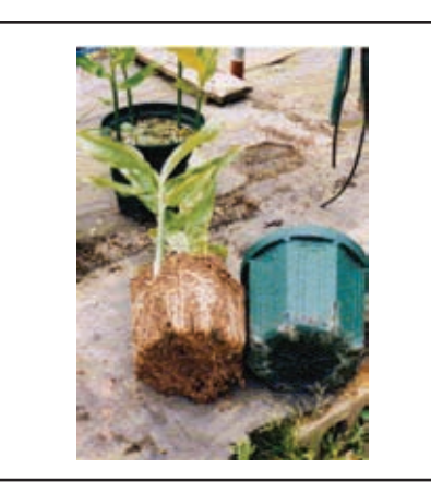
Figure 7. Udo ( Aralia cordata ) in CS POT (24 cm in diameter).