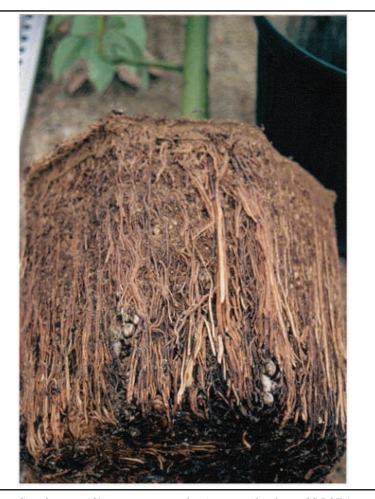
Figure 3. Camphor tree ( Cinnamonum camphora ) 1.8 m in height, in CS POT (24 cm in diameter). After 1^{1}/2 years of culture in CS POT many new roots are formed down from the proximal part of the root. When viewing the growing points you will note that many of the root tips have ceased growth.

translocation of growth hormones produced from the aboveground to roots, it can become possible for the main root to have new roots not only at the lower but also at the upper part. Thus, it is clear that the main root has new roots at the middle part (Figs. 4 and 5).