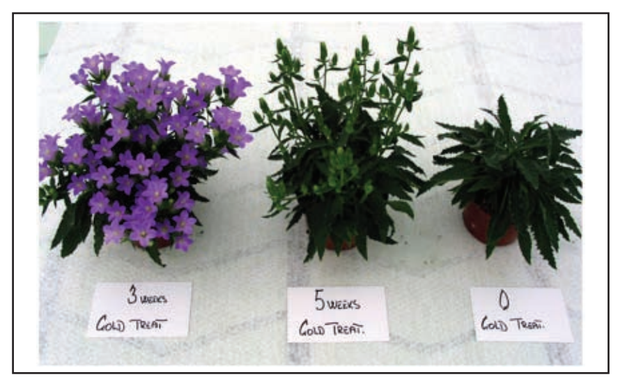
Figure 2. Cold treatment for flower induction: 5-7 °C for 3 or 5 weeks compared to no cold treatment.

Campanula cochlearifolia Lam 'Elizabeth Oliver' English name: Dwarf Bells, Scandinavian name: Dværg klokke. 'Elizabeth Oliver' appeared in a garden near