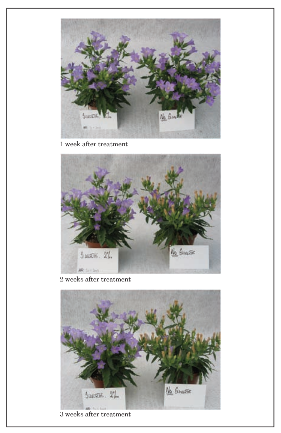
Figure 3. Silver thiosulphate treatments to improve longevity of flowers on Campanula tubulosa 'Sfakion'.