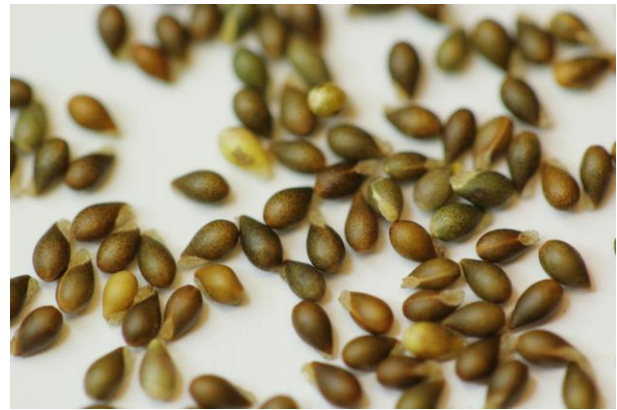
Figure 4. Viola pedatifida (prairie violet) seed showing the elaiosome that attract ants.

after trying several stratification methods. The observation that has been documented is that the ants carry the ginger seed into their colony where they ingest only the elaiosome, discarding the rest of the seed in a special chamber where it eventually germinates and establishes its own colony.