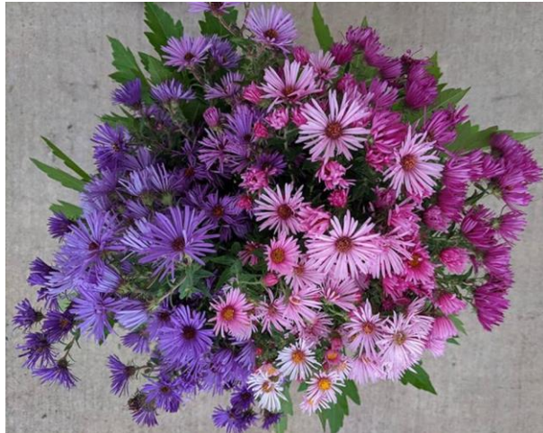
Figure 1. Genetic diversity within an ecotype in Symphotrichum novae-angliae (New England aster).

The largest idea that sets a native plant nursery apart from a traditional grower is that a native plant nursery works exclusively with genetically diverse crops (Fig. 1).