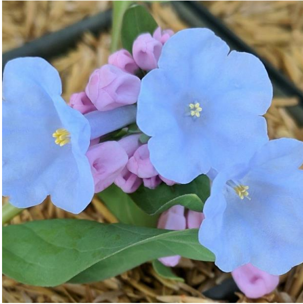
Figure 3. An example of reverse engineering is the use of rice hulls on our ephemeral crops for weed control, crop is Mertensia virginica (Virginia blue bells).

So that summer we waited for the ephemeral crops to go dormant and applied about \frac{3}{4} in. of rice hulls to the pots. This reduced our labor and spray needs by almost 70% and yielded a much cleaner looking plant the following spring. Since then we have taken to using rice hulls on most of our crops as it seems to lessen weed and liverwort pressure, as well as help retain moisture and reduce some irrigation needs. One interesting observation I have made about the rice hulls is that it lowers the temperature of the potting mix. This can be used to our advantage when growing cool season crops, but it does delay warm season grasses from breaking dormancy in the spring as well as increasing finish times in the summer.