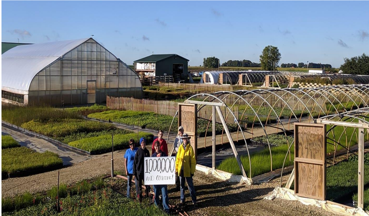
Figure 5. Part of the production team at Pizzo Native Plant Nursery celebrating hitting the production goal for the year.

considering employee retention. At PNP we have worked hard to develop a strong company culture and as a result we have developed a team that is engaged, empowered, and motivated (Fig. 5).