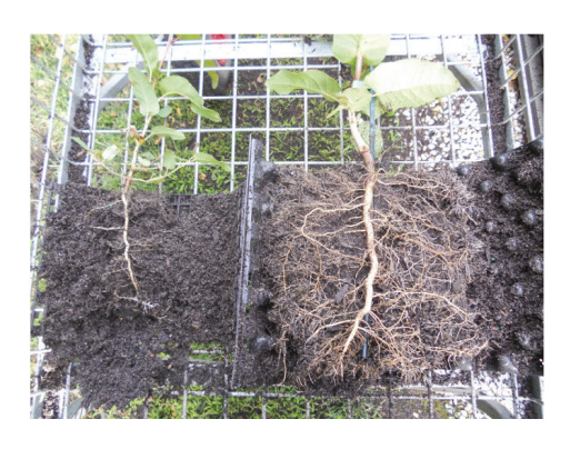
Figure 3. The two typical root systems — both at Day 133 from seed — show how the radical is surrounded by an array of laterals uniformly arranged in 3D space. LHS: sown in 1.5 litre 3 DARP, RHS: sown in 8 litre 3DARP.