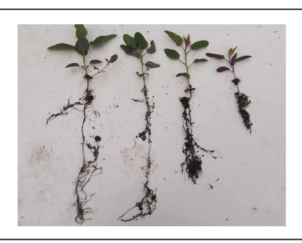
Figure 2. The effect of pot size on seedling caliper in the first 28 days from seed.

Note that air root-pruning has started already on the 3DARP seedling.