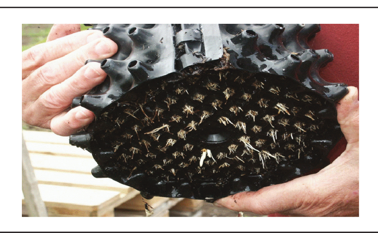
Figure 1. The third dimension in air root-pruning.

Consensus opinion among five tree growers with vast experience was that: more than 20% of advanced trees fail after planting and even more are seriously compromised.