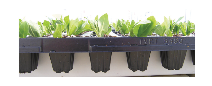
Figure 2. Propagation tray sitting above the leachate collector.