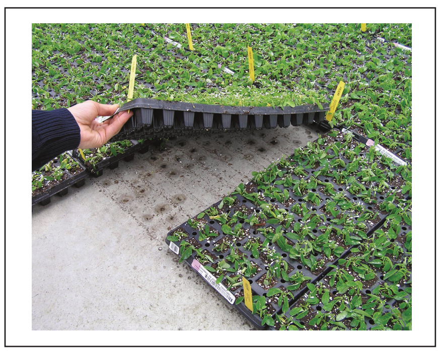
Figure 6. A check for correct hydration after night misting.

Ball Horticulture (Healy, 2008) has developed a moisture index for growing substrate (Table 1). A copy of the article is available for free at: <<u>http://www.ofa.org/</u>pdf/bulletins/08_marchapril.pdf>, with guidelines for different crops. Large-scale propagators train their staff to ensure they can identify the five stages of moisture. For seed germination, crops can be grouped as to the ideal moisture level (for example W4 for pansy and W2 for verbena). Specific seedling plug crops are watered at each stage when they dry down to a specific moisture level (for example, W2) and enough water is applied to reach an optimum level (such as W4). In general, if your crop is consistently at W5 this indicates overwatering. This concept can also be applied to finished plant production.