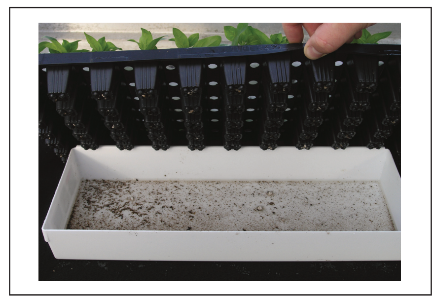
Figure 3. Solution in leachate collector after 1 week.