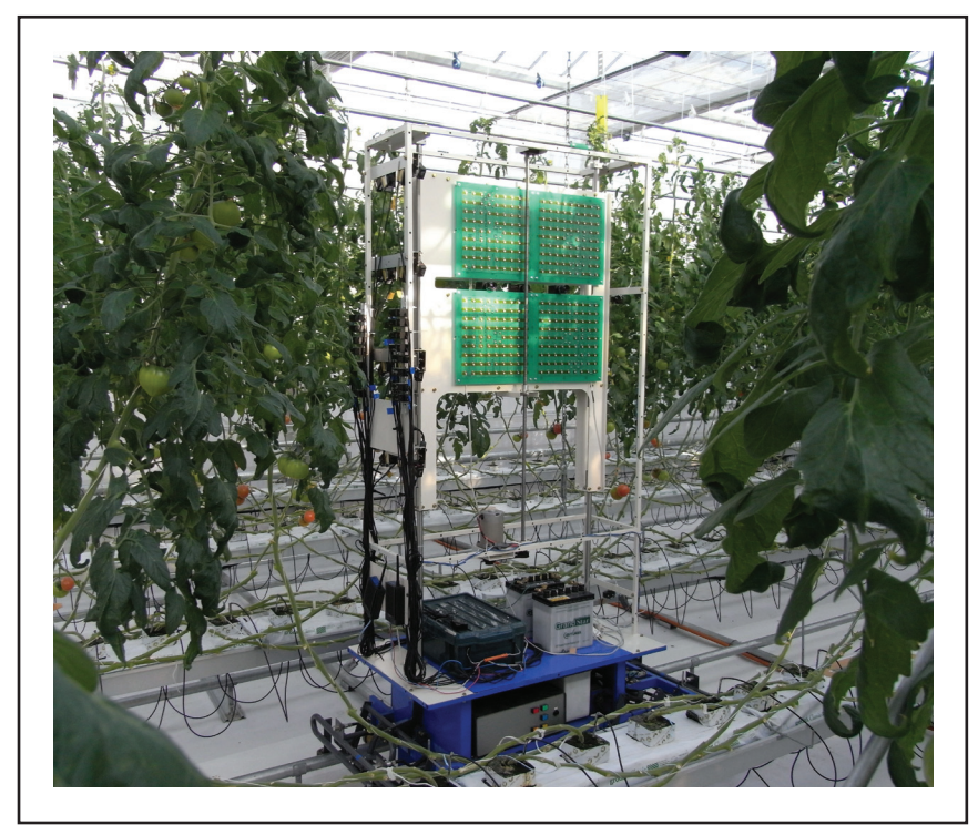
Figure 2. Plant diagnosis robot.