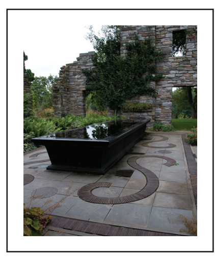
Figure 5. Chanticleer Gardens.

Posters Session. Viewing will be available throughout the day and evening.