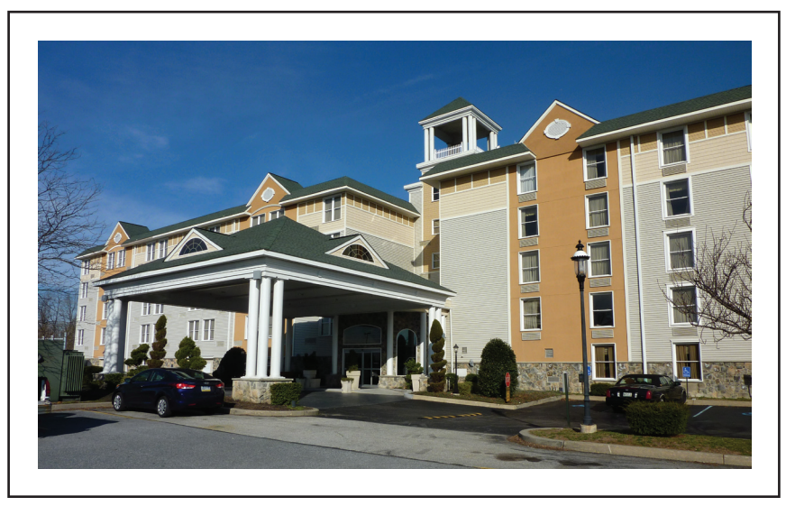
Figure 1. Host hotel.