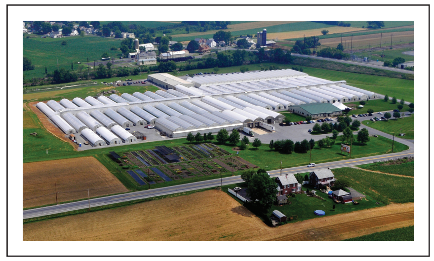
Figure 3. Aris / Greenleaf Perennials.