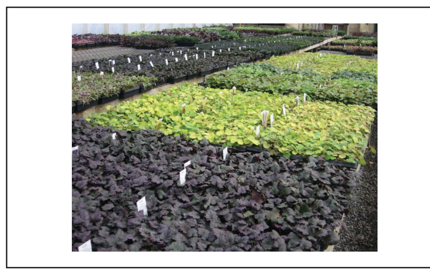
Figure 2. Creek Hill Nursery.