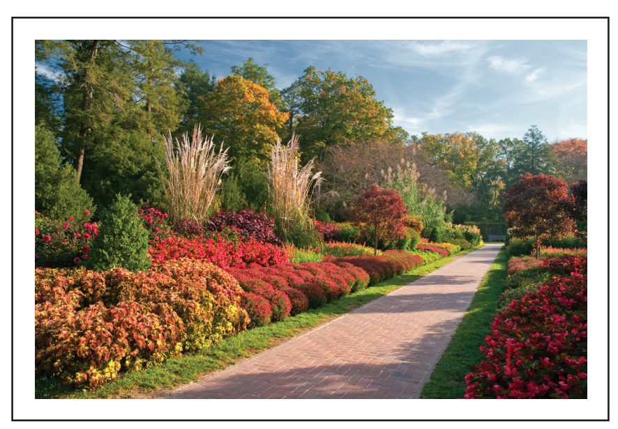
Figure 6. Longwood Gardens.