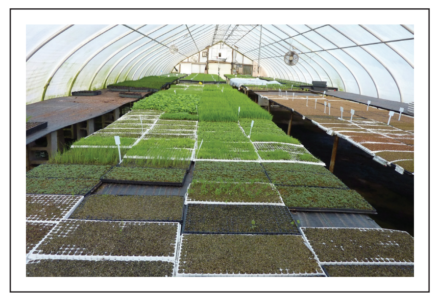
Figure 7. North Creek Nurseries.