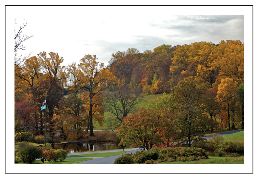
Figure 8. Winterthur Garden.