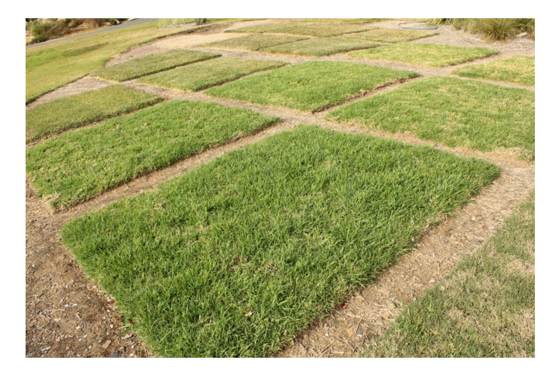
Fig. 4. The plot in the front was the best colour getting a rating of 9. It was the Kenda kikuyu sprayed with Carbon Trader. Notice in the background the colour of plots is not as good.

Clippings at the end of winter were taken from the Kikuyu plots, and significant differences between the treated and not treated plots were found. More clippings were measured from the treated plots. See Tables 3 and 4.