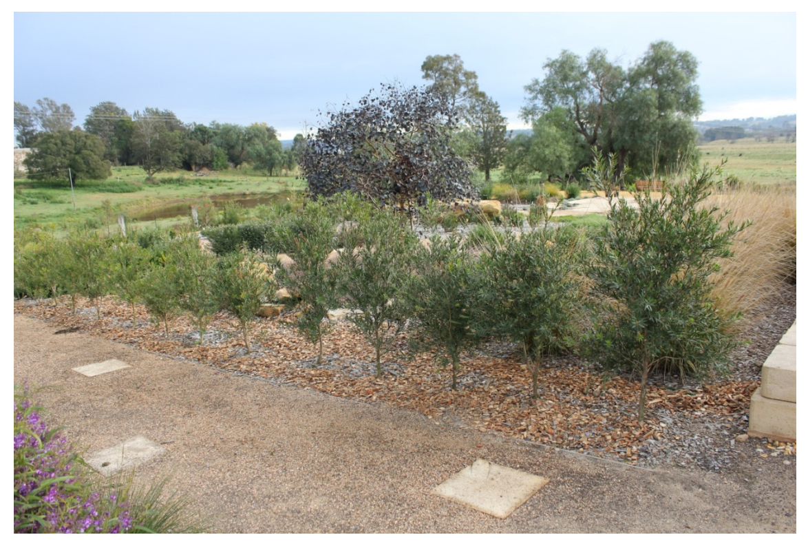
Fig. 6. The callistemons on the right were treated with Carbon Trader, the ones on the left were not.

For turf the implication that a warm season turf can get a high quality rating of 9 out of 10 after many frosts, near the middle of winter, is that, a combination of Carbon Trader, and Kanda Kikuyu could eliminate the need for overseeding in many cooler winter regions of Australia. Further a turf that actively grows in winter could result in far better wearing sports fields for winter sports such as Rugby, AFL, and Rugby League.