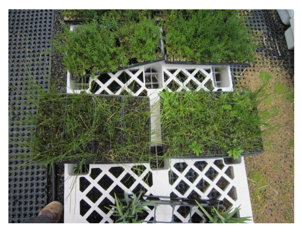
Fig. 2. The above photo shows Shara<sup>™</sup> lomandra in Sept. 2011 in an outside trial. Left was treated with Barricade<sup>®</sup> at 45 ml per 100 m<sup>2</sup>, and right was not treated.

Fig. 1. Shara<sup>™</sup> lomandra treated and placed in the hot house showed how well the Barricade<sup>®</sup> worked.