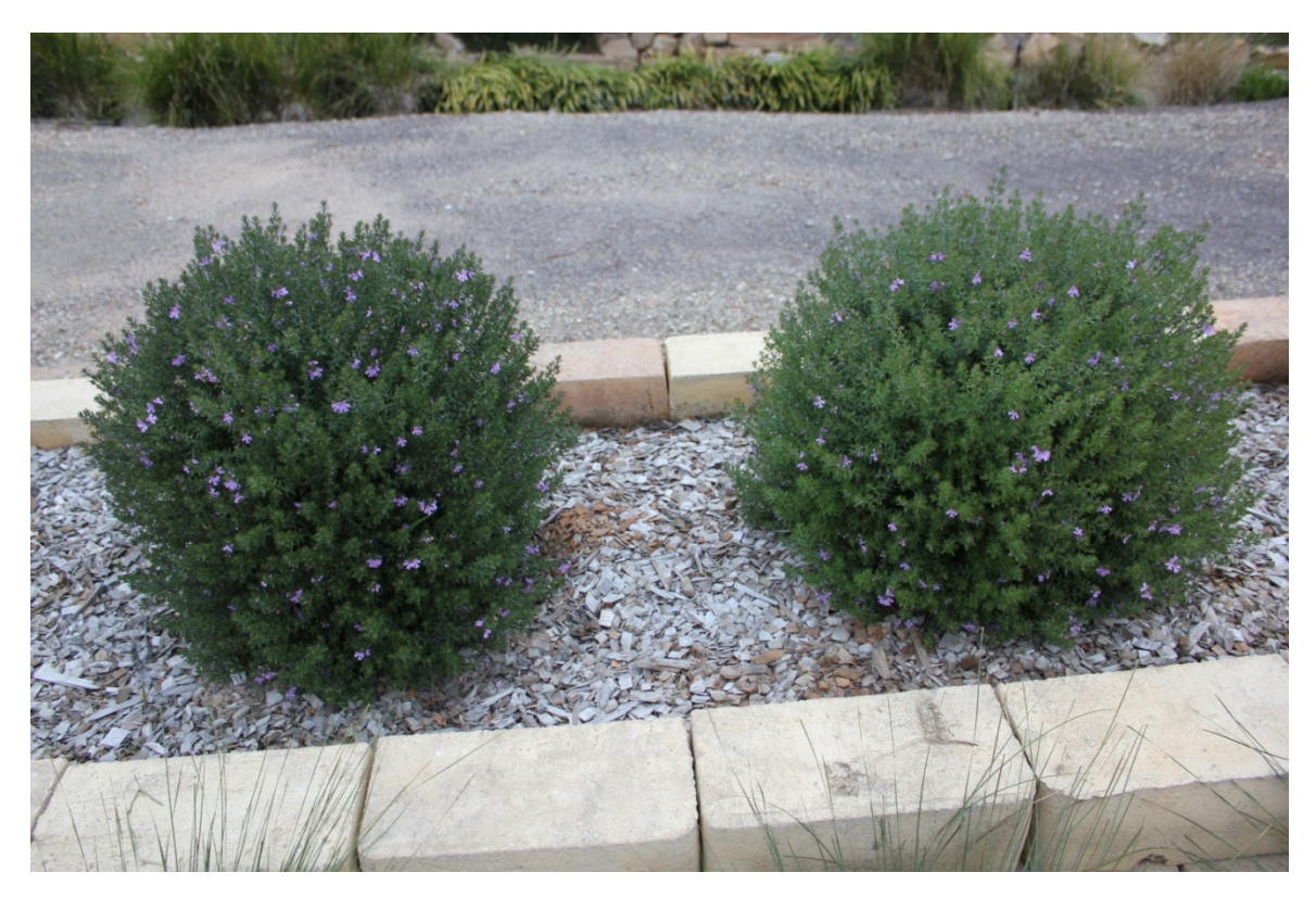
Fig. 5. The plant on the left was treated with Carbon Trader around a month earlier; the one on the right was not.

more structured evaluations are needed, however clear differences could still be seen between many untreated and treated plants. For whatever reason these difference occurred, this could allow many nurseries to ship better looking plants in winter and early spring, or to slightly protect plants in colder areas. Note; it took 4 to 6 weeks for most plants to no longer show the small dots of black on the leaf.