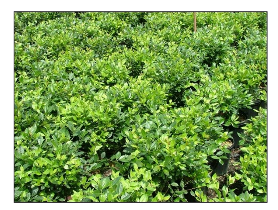
Fig. 3. Two-year-old crop of Ilex verticillata .