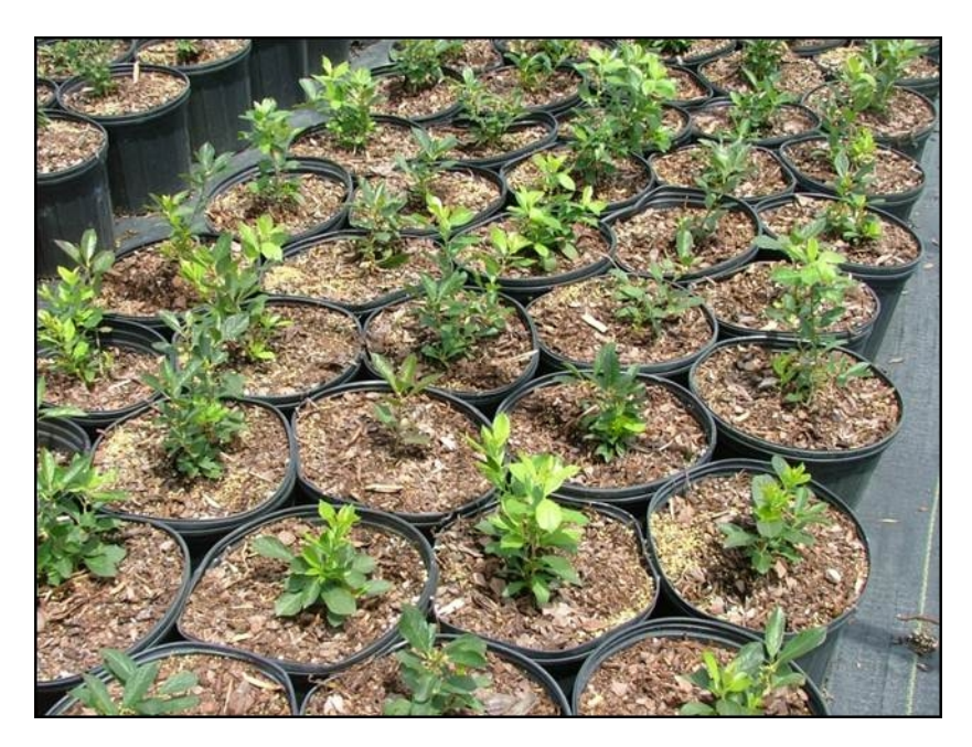
Fig. 2. One-year-old crop of Ilex verticillata .

the pot may be affected by solar radiation more than the pot tight crop), but the transpirational water loss will be much higher. Leaching fractions allow a grower to distill the many differences mentioned above down to a single, easily quantified measurement.