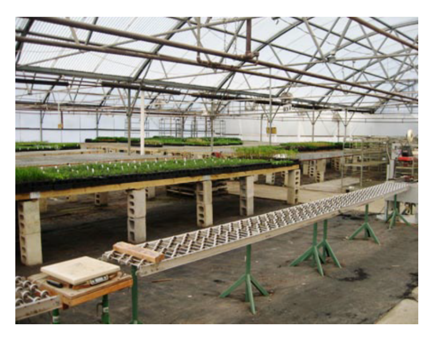
Fig. 4. Central location in the shipping greenhouse where a production line was employed to clean and organize materials and made ready for shipment.