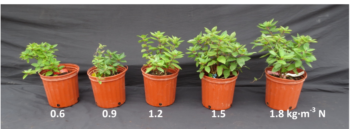
Fig. 1. Response of euonymus ( Euonymus alatus 'Compactus'; above) and hydrangea ( Hydrangea paniculata 'Grandiflora'; below) plants to five fertilization rates. Plants were transplanted on 5 June 2013 into 2-gal containers having incorporated Polyon<sup>®</sup> 16-06-12, 5-6 month controlled-release fertilizer at five rates. Photos were taken in September 2013.

By understanding species-specific responses to fertilization and unique optimal fertilizer rates for individual nursery crops, growers can divide crops into fertilizer requirement groups (i.e., low, medium, and high groups). Groups of crops with different fertilizer requirements can be potted with their optimal fertilizer rates at different times, to ensure planting efficiency. By doing so, growers can easily optimize plant growth and minimize excessive nutrient loss from over-fertilization. Based on our observations and discussions with growers, many Ontario nursery operations are currently applying one fertilizer rate for all plant species on the same farm, and some operations are grouping their plants according to water demand, which is a good practice. Growers may like to use these species-specific optimal fertilization rate results (Zheng et al., 2013), and information from other sources, to determine appropriate nursery crop grouping during production.