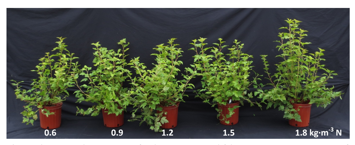
Fig. 3. Plant growth response of Physocarpus opulifolius 'Nugget' to a range of controlled-release fertilizer application rates. Plants were transplanted on 5 June 2013 into 2-gal containers having incorporated Polyon<sup>®</sup> 16-06-12, 5-6 month controlled-release fertilizer at five rates. Photos were taken in September 2013.

Some extension publications suggest the best way of diagnosing nutrient disorders is by evaluating plant leaf nutrient content by conducting a tissue analysis (e.g., OMAFRA, 2014). This general practice may help to identify nutrient deficiencies for certain species under certain conditions. However, for some species leaf tissue analysis alone may not be able to identify nutrient deficiencies. For example, the overall appearance (Fig. 3) and the measured growth attributes of 'Nugget' ninebark clearly showed that plants fertilized with CRF at 0.6 kg·m<sup>-3</sup> N were inferior to plants fertilized at higher rates; however the leaf tissue nutrient analysis showed no differences in N, P, K, Mg, or Ca content among plants grown at different CRF rates (Clark and Zheng, 2014).