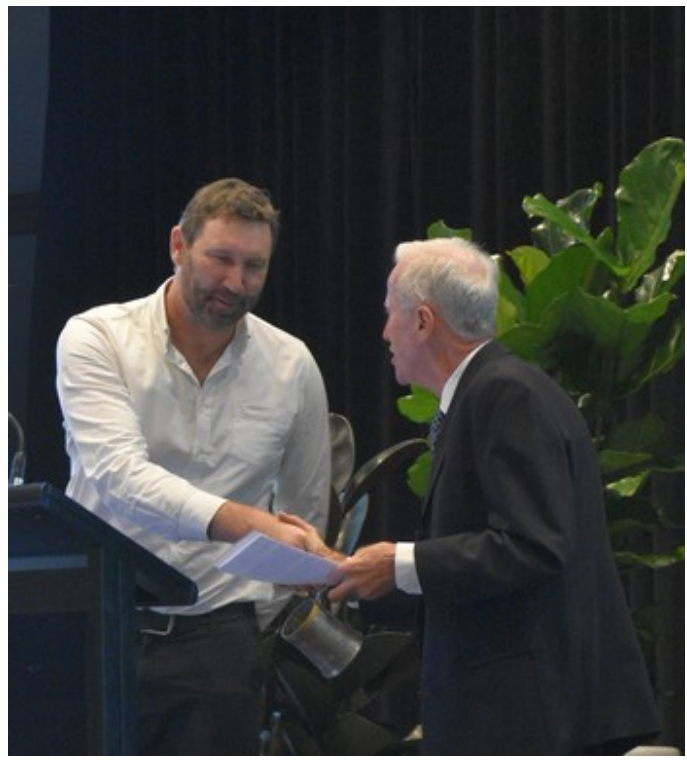
contribution to horticulture, especially recognising regular contributions of articles on behalf of IPPS to the Hort Journal.