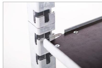
Patented posts /hooks