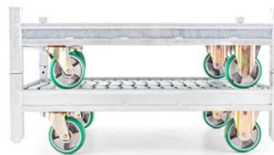
Packed down 1:5,5

*Per circulation you save minimum 12 labour minutes . Calculated savings by 12 rotations per year.